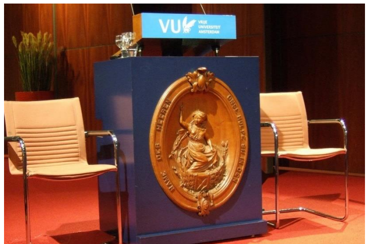
The wooden plaque above the door of the building on the Keizersgracht now adorns the pulpit in the auditorium of the Free University.